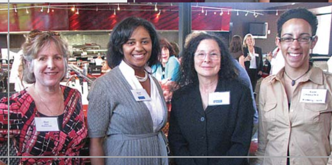
Atlanta Women's Forum hosts clients at a special reception

Bryan Cave Was Named one of MultiCultural Law Magazine's