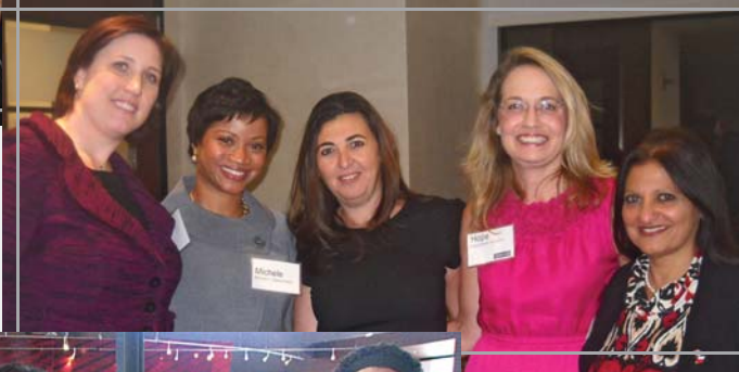
New York Women's Forum reception honoring United Nations Day with the Ambassador of the Kingdom of Bahrain to the United States and a trade representative from the Kingdom of Bahrain State