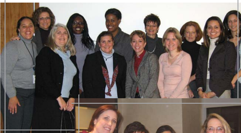
Washington, D.C., Women's Forum gathers for a panel discussion