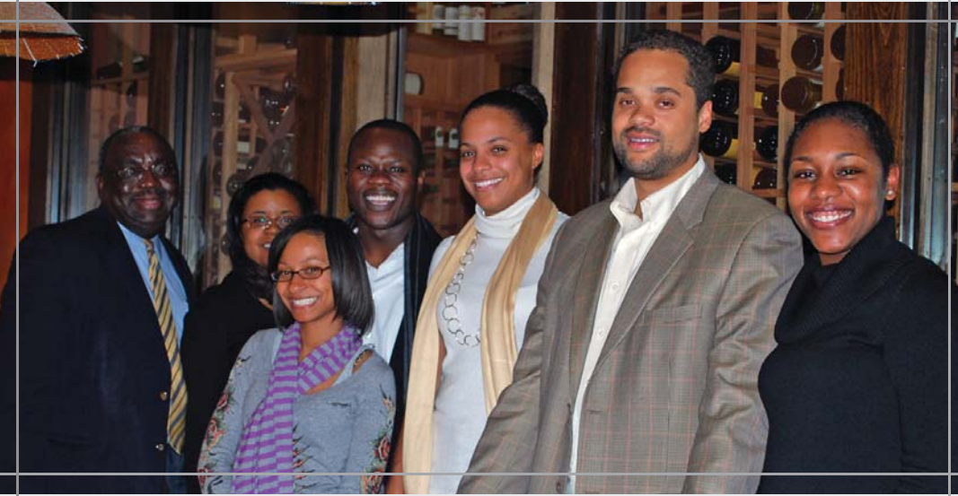
St. Louis Lawyers of Color affinity group's holiday dinner